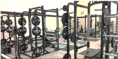
Coral Glades High