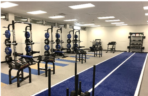
Fort Lauderdale High