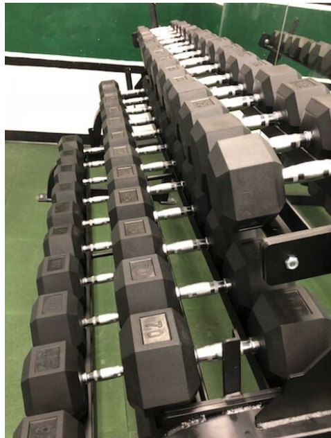
Charles W. Flanagan High