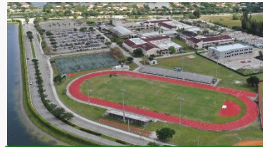
Charles W. Flanagan HS