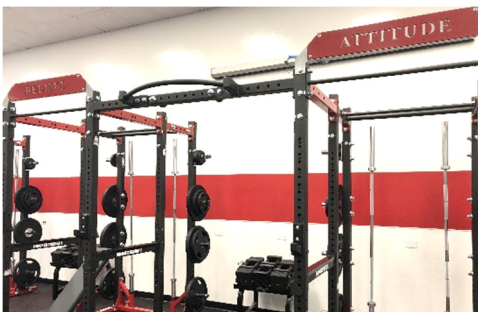
Cooper City High