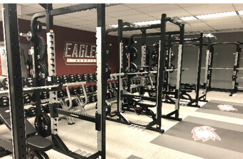
Marjory Stoneman Douglas High