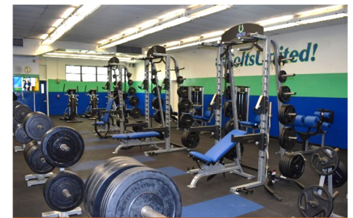
Coral Springs High