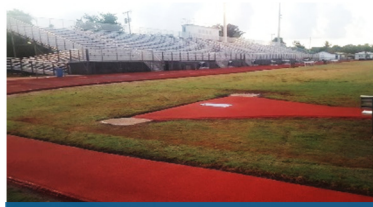
Pompano Beach HS