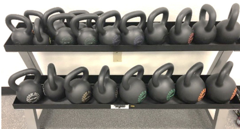
South Plantation High