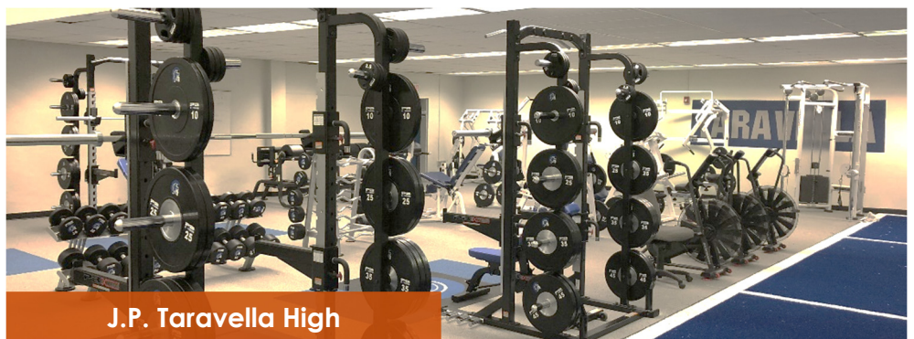
J.P. Taravella High