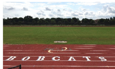
West Broward HS