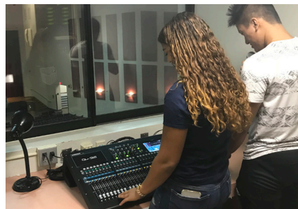
Sound System Upgrades