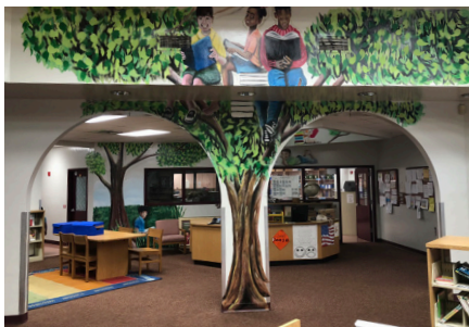
Media Center Improvements