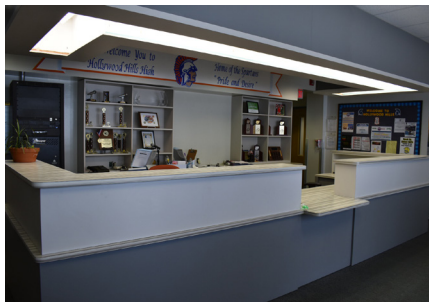
Welcome Center Renovation