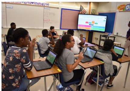
Televisions for Classrooms